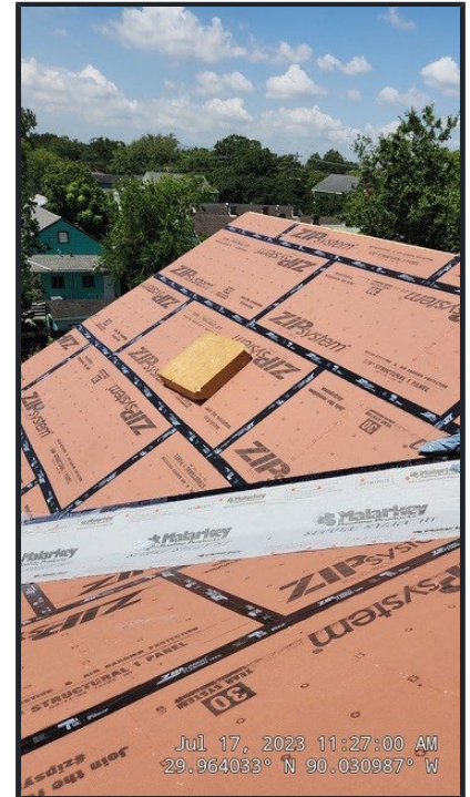
Taped Sheathing Seams Photo

Geotagged photos must be taken before underlayment is covered (minimum one photo of each side of roof). Underlayment: Underlayment shall meet ASTM D226 Type II, ASTM D4869 Type III or Type IV (i.e., 30# felt or synthetic). NOTE: 15# felt (Type I) is not allowed. Underlayment shall be two layers applied in the following manner: apply a 19-inch strip of underlayment felt parallel to and starting at the eaves. Starting at the eave, apply 36-inch-wide sheets of underlayment, overlapping successive sheets 19 inches. Distortions in the underlayment shall not interfere with the ability of the shingles to seal. End laps shall be 4 inches and shall be offset by 6 feet. The underlayment shall be attached with corrosion-resistant fasteners in a grid pattern of 12 inches between side laps with a 6-inch spacing at side and end laps. Underlayment shall be attached using annular ring or deformed shank nails with 1-inch-diameter metal or plastic cap.