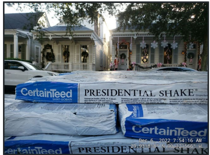
Shingle Packaging Photo