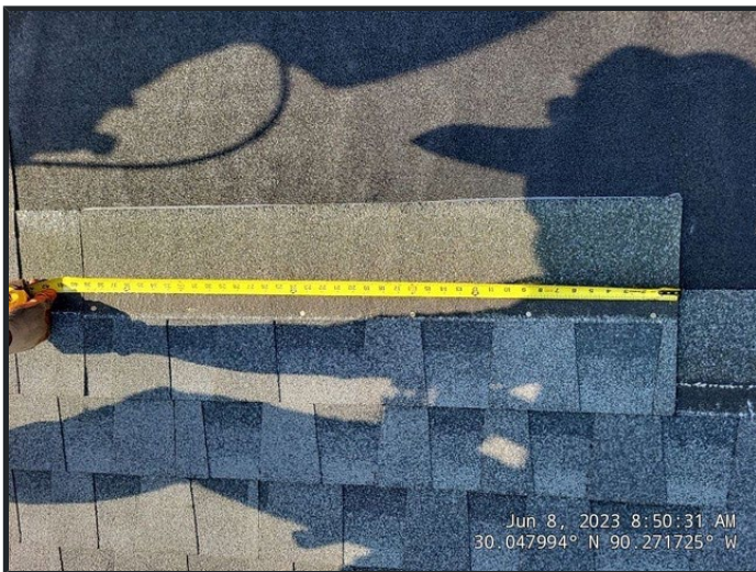
Asphalt Shingles and Nailing Pattern Photo